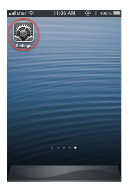
Exhibit 2: Do Not Disturb